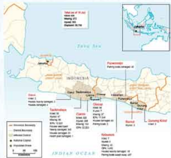
To provide relief to the victims of the tsunami that struck the south-western coast of Java on 17th July 2006, Sri Sathya Sai Organisation of Java drew up a plan and started implementing it immediately.

On 1st June 2006, one public kitchen was set up in Klaten and another in Gunung Kitul. In addition, large quantities of food, healthcare materials, and clothes were delivered. Sai Medical Teams increased from three to six. On 3rd June 2006, Sai devotees from Jakarta began to manufacture bricks for the reconstruction of many houses that were destroyed. The flow of relief materials, food and clothes accelerated. On 4th June 2006, Sai devotees from Bali set up many tents to house homeless victims. Working with Sai Youth, they began reconstructing damaged houses. On 5th June 2006, rebuilding and rehabilitation work was initiated by Sai devotees in several villages, and Sri Sathya Sai Central Council provided financial aid, building materials and financial resources to rebuild houses.