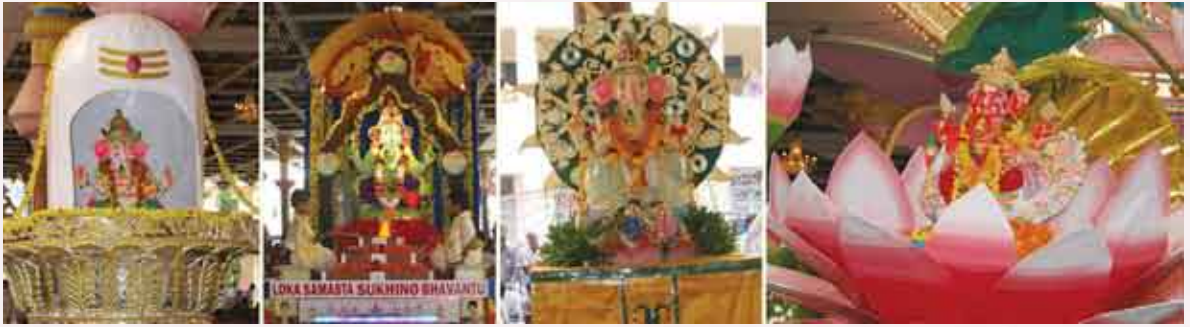
Some of the beautifully decorated vehicles with Ganesh idols which were brought to Sai Kulwant Hall for Bhagavan's blessings before being taken for immersion.

Bhagavan blessed all the students and staff members accompanying them.