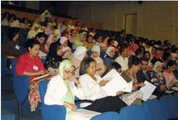
As many as 120 teachers from 14 schools participated in the Teacher Training Conference conducted in Casablanca, Morocco for introducing Sri Sathya Sai Human Values in the curriculum.

everyone participated enthusiastically. The teachers made sincere efforts to incorporate Sathya Sai Human Values into their training sessions and even in their interactions during the conference. Later, various schools discussed together and reported back on how they would take SSEHV further. A resolution was made to translate SSEHV books into French and Arabic languages to facilitate their use in schools in Morocco. At the end of the conference, all the teachers were extremely enthusiastic and eager to implement SSEHV as part of the curriculum.