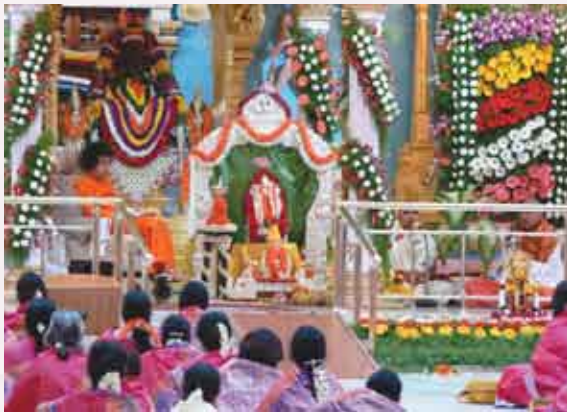
Bhagavan graced the occasion by His Divine Presence during the performance of Varalakshmi Vrata in Sai Kulwant Hall.

Vedic Mantras and auspicious rendering of Nadaswaram music by a group of musicians when He came to Sai Kulwant Hall at 7.30 a.m. Soon after coming to the dais, Bhagavan went into the rows of the ladies who were taking part in this function and showered His blessings on them. Bhagavan returned to the dais at 7.40 a.m. and formally inaugurated the function by lighting the sacred lamp placed there. The programme of Puja started with the worship of Lord Ganesh by the participating ladies as instructed by the chief priest. After this, the ladies performed Puja of goddess Varalakshmi for nearly one hour as per the instructions given by the chief priest. At the conclusion of the Puja, the chief priest offered Arati to the idol of Varalakshmi placed on the dais. In the end, Prasadam blessed by Bhagavan was distributed to all. The programme came to a close with Arati to Bhagavan at 9.00 a.m. A sumptuous feast was offered to all the participating ladies in the South Indian Canteen at the conclusion of the function.