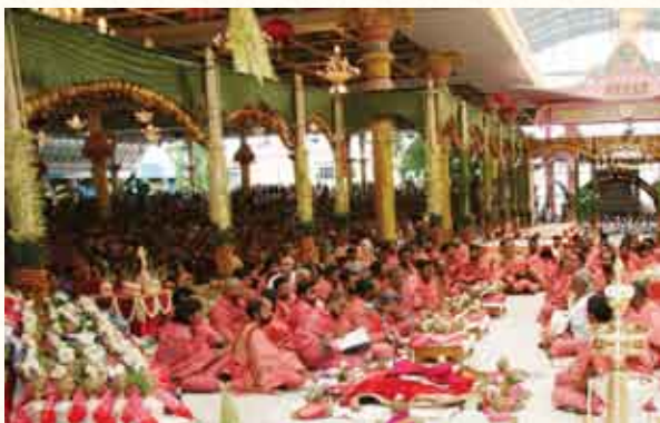
A view of the beautiful Yajna Mandap that was set up in Sai Kulwant Hall. The picture shows the priests doing Rudra Parayana in the Mandap.

presentation of devotional music programmes by well-known musicians and the students of Sri Sathya Sai Institute of Higher Learning, Prasanthi Nilayam. The venue of the Yajna was Sai Kulwant Hall which was beautifully decorated with colourful buntings, charming