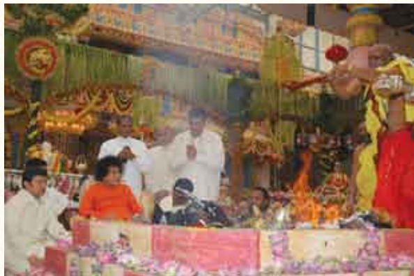
Poornahuti of the Ati Rudra Maha Yajna was performed by Bhagavan on 20th August 2006 by offering oblations in Yajna Kunda with His Divine Hands.

a long silver ladle instead of the usual short wooden one while Rudra chanting continued with full vigour and devotion by the priests, students and devotees. At the conclusion of Rudra Homa, Sai Gayatri Homa began at 8.15