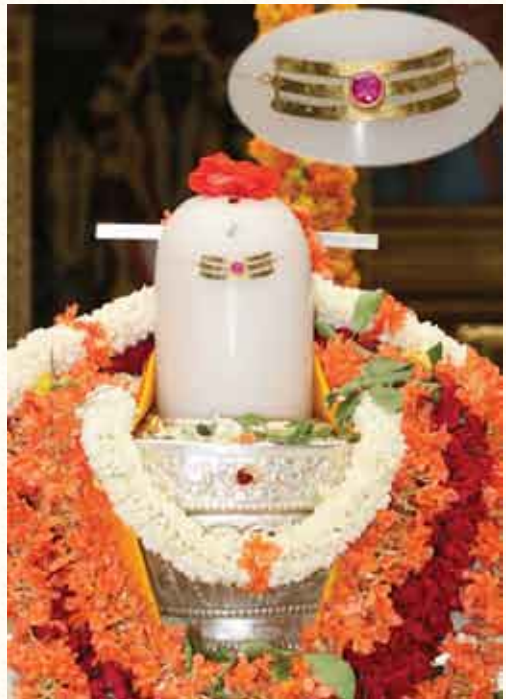
Abhisheka and Puja of the Linga, symbolising the manifest form of Siva, was performed along with Rudra Parayana. (Inset) Beautiful jewel materialised by Bhagavan at the time of Prana Pratishtha of the Linga.

On 10th August 2006, Sai Kulwant Hall started reverberating with sweet notes of Mangalavadyam by Nadaswaram musicians and Vedic chants of priests at 5.30 a.m. Bhagavan came to the Hall at 6.10 a.m. and blessed the mammoth gathering of devotees