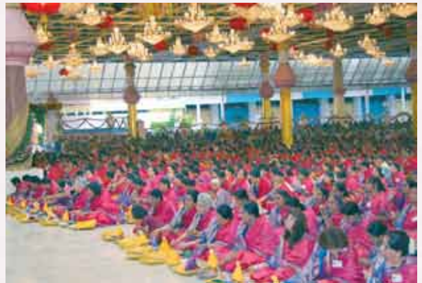
A section of the participants in Varalakshmi Vrata performing worship of the goddess.