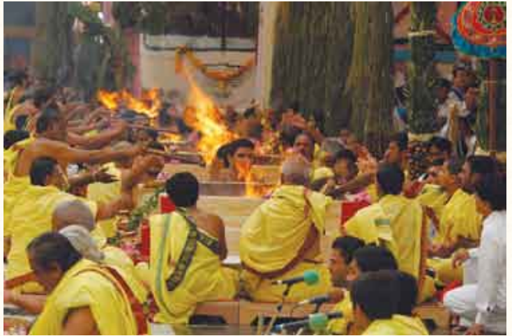
Rudra Homa being performed by the priests by offering oblations in the sacred fire along with chanting of Vedic Mantras.

the sacred fire in the traditional way by churning one piece of wood over the other. They brought it to Bhagavan for His blessings before placing it in the Yajna Kundas. After this, the chief priest described the importance of the Ati Rudra Maha Yajna and gave details of Linga Abhisheka, Rudra Parayana, Rudra Homa and other rituals which were proposed to be performed on 11 days from 10th to 20th August. At 7.30 a.m., the chief priest started the Panchamrita Abhisheka and Puja of the Sayeeswara Linga amidst Vedic chants. Collective